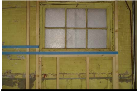
The kitchen wall and windows exposed

The kitchen remodeling will see a dishwasher and water filter installed together with wooden cabinets, a new wall-mount microwave (which will also provide an updated and upgraded vent system for the stove), new flooring in the kitchen and both bathrooms especially designed for use in basements and able to withstand substantial water exposure, and new toilets in the bathrooms to bring them up to current building code. The cost of the downstairs renovation is estimated to reach nearly $10,000...the total amount of available cash. Protected in a CD is another $6,000, but other issues with the church building need to be addressed as well in the near future, including: